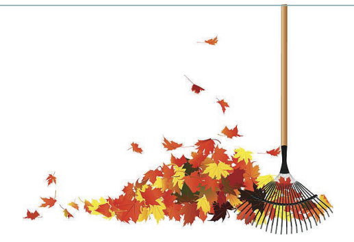
Do you need help with your HOUSE, YARD, or CAR?

Does your family need special COUNSELING?